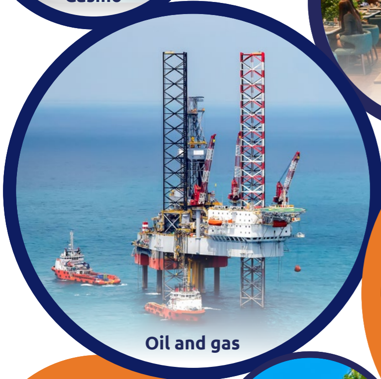
Oil and gas